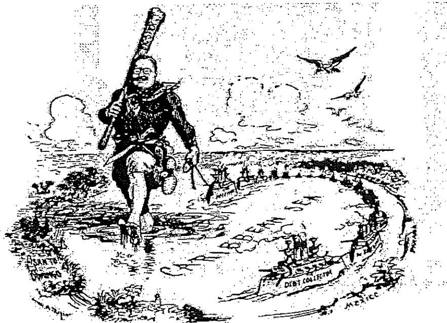
Figure 2.25 Cartoon by Rogers in New York Herald (New York: Sun, Inc., 1905).