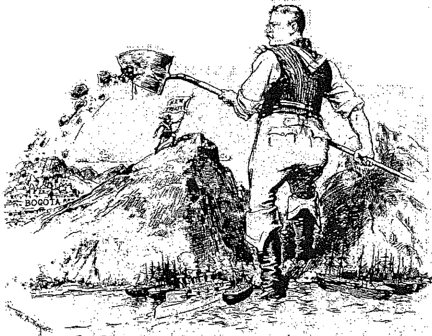
Figure 1.25 Cartoon by Rogers in New York Herald (New York: Sun, Inc., 1903).