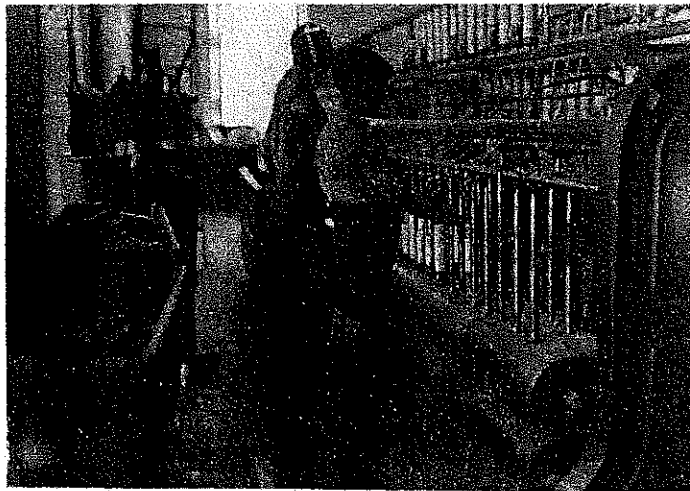
Child Workers in a Spinning Factory c. 1880