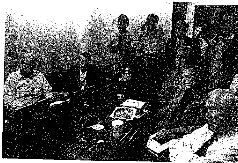
President Barack Obama and Vice President Joe Biden, along with members of the national security team, receive an update on the mission against Osama bin Laden, May 1, 2011